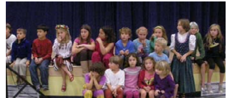
Students sing on Multi-Cultural Night

committees, and the results of a survey sent to parents in the spring.